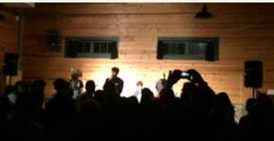
Ristfut plays to a full house of fans at the Depot Arts Center during the Spring Fever benefit concert last month.