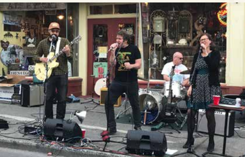
The Mosstones rock the sidewalk at Bikespot last month.

The Anacortes Public Library features the Manieri Jazz & Swing Collection—specially chosen books, CDs, and DVDs on the uniquely American art of jazz and swing music. Sponsored by the Dominic & Patricia Manieri endowment, the entire collection is accessible for check-out with your library membership.