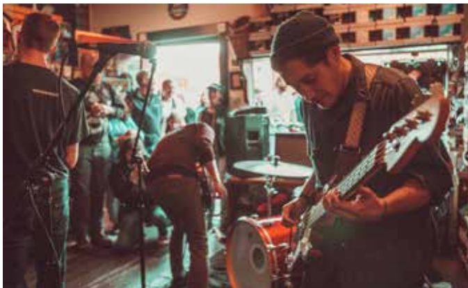
Buffet rocks to a full house during their record release party at Bikespot last month.